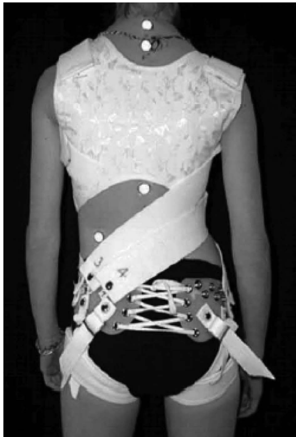
Figure 2. The Corrective Movement ® principle promoted by the SpineCor system.

shoulders (A, B). This action will also prevent the shoulder rotation from being absorbed by the thoracolumbar or lumbar segment of the spine. This movement represents a de-torsion between the vertebral segments over and under the apex, associated with coupled movements in the frontal and sagittal plane. They then reach an improved alignment with the vertebrae involved in the scoliosis. The corrective movement is also accomplished with a slight down tilt of the right shoulder (A). The right lateral shift of T 1 in relation to SI should consequently be reduced (C). This combination of movements should result in the straightening of the spine.